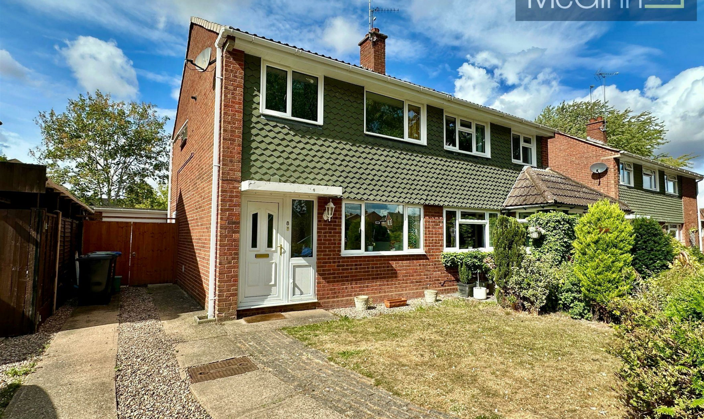
Fairwater Crescent , Alcester, B49 6QX